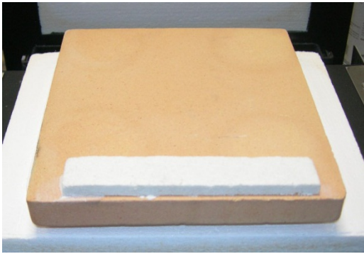
Floor Tray with Lift Pad attached.

Thank you for your purchase of the IBEX Apex Burnout Oven. Your Apex Burnout oven comes ready to plug in and program. The only installation or setup would be the installation of the Floor Tray, pictured below. Due to the nature of the cast muffle, the floor has a slight slant, or decline, from manufacture. The Floor Tray has a high temperature pad adhered to the underside of the Floor Tray to raise the front end level with the back, also pictured below.