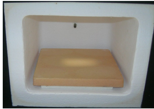
Floor Tray installed.